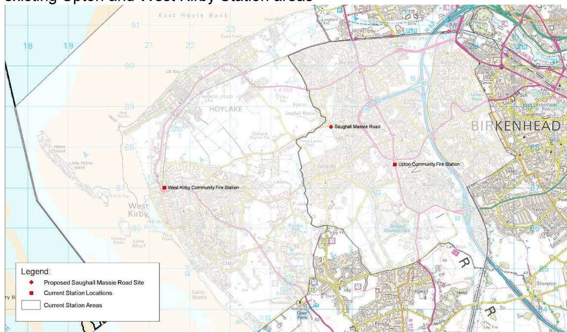
Map 1: Location of the proposed Saughall Massie Road site in relation to the existing Upton and West Kirby Station areas

Author: Business Intelligence Date: 03/02/2015 Produced using MapInfo Strategy & Performance